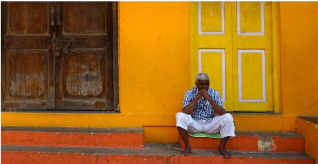
Worli Koliwada street life