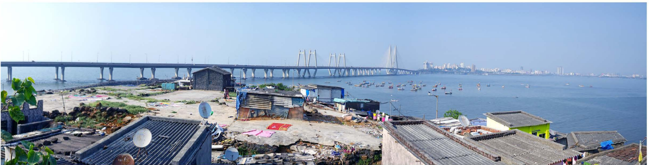
view c: From Worli Fort looking north across the competition site