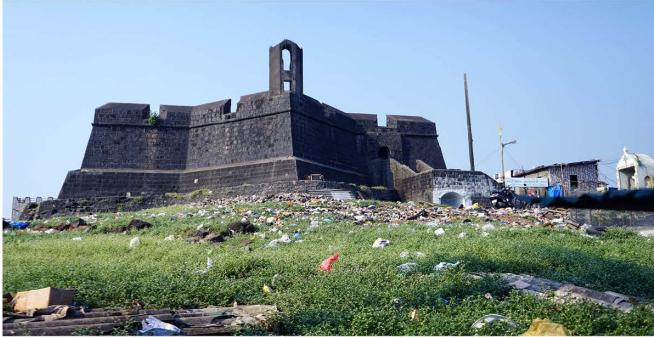
view e: Worli Fort, built by the British in 1675