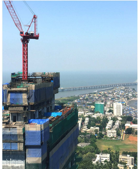
View overlooking the Worli Koliwada, an urban fishing village that houses the competition site, from a luxury high-rise currently under construction in Worli, Mumbai