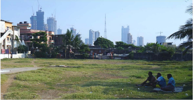
view f: Worli Koliwada open space and informal cricket field