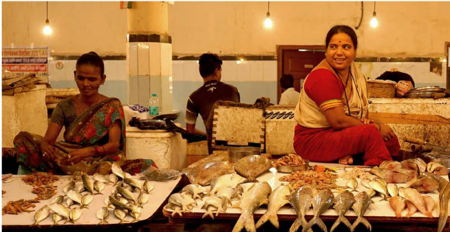
Dr Kharude Market