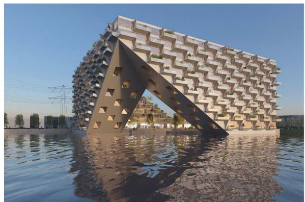
Sluishuis, a mixed-used building proposal in Amsterdam by BIG and Barcode Architects

Project submissions are not required to meet each of the above objectives, though meeting some or all objectives is strongly encouraged.