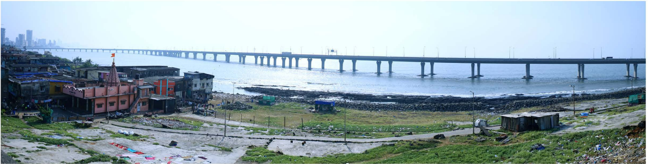
view b: From Worli Fort looking west over the Bandra-Worli Sea Link bridge