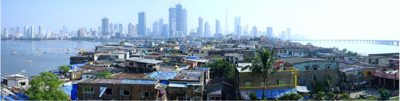
view a: From Worli Fort looking south over the koliwada to Worli neighborhood