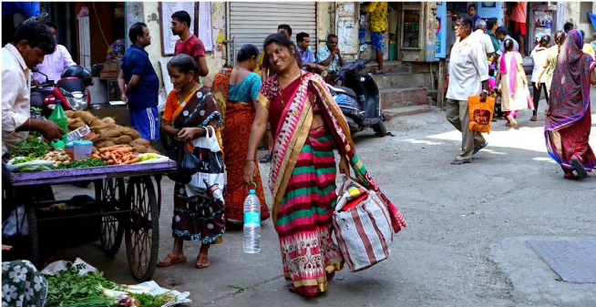
Worli Koliwada street life

Additional photographs available in registration package