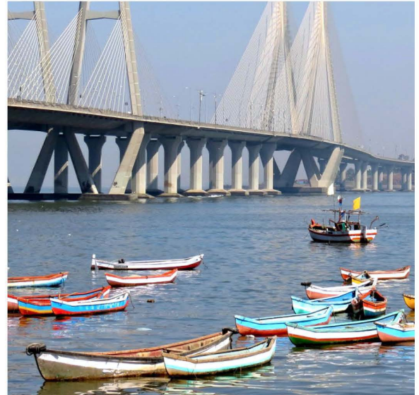
Traditional fishing boats bob in the Mahim Bay near the Bandra-Worli Sea Link