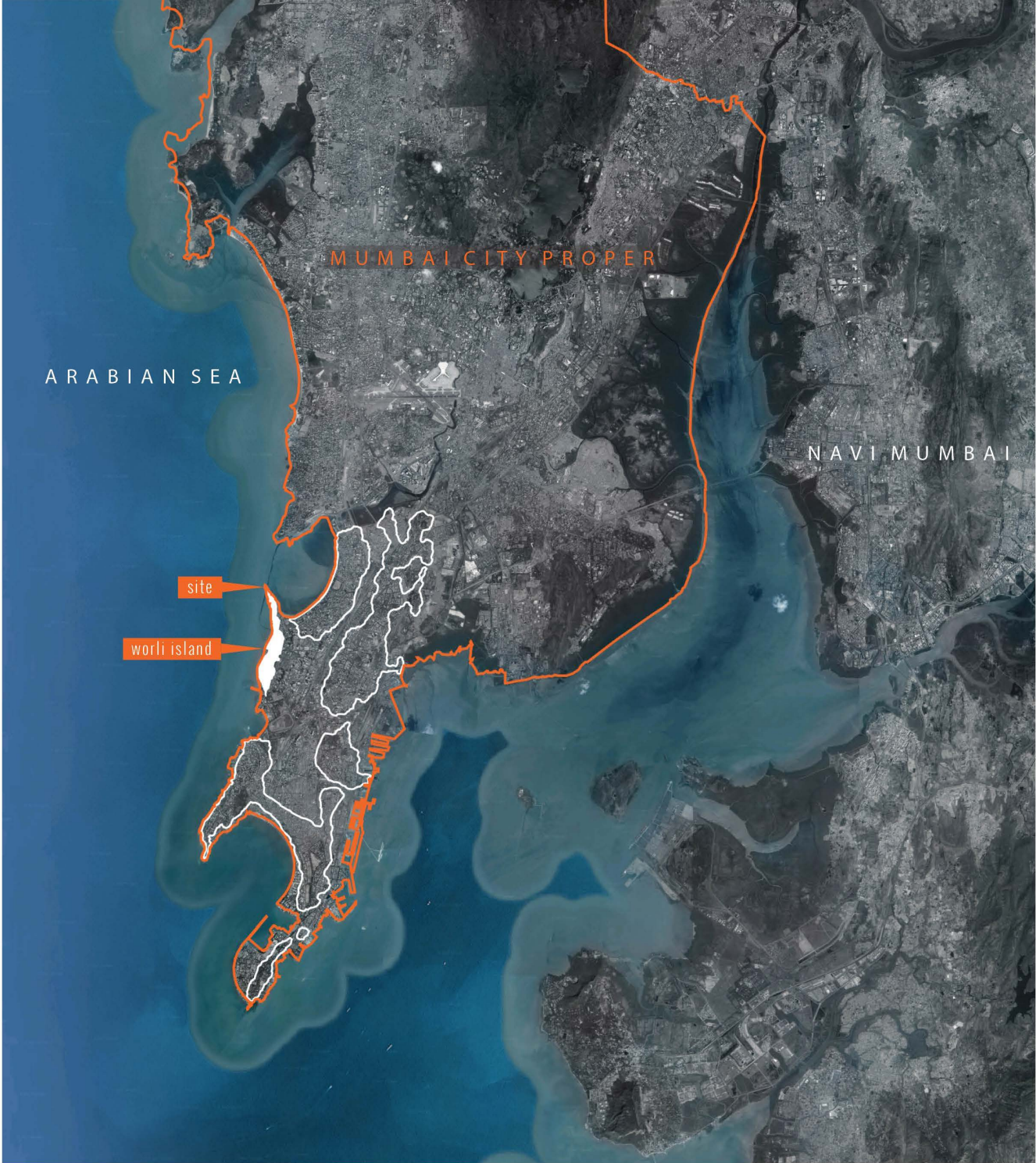
The seven original islands of Mumbai, including Worli Island, outlined in white; current boundaries of the city proper, outlined in orange