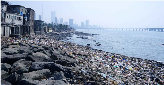
view g: Looking south along the west coast of Worli Koliwada