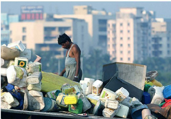
“City of ‘haves’ and ‘have-nots’”

Physical and social segregation, which both reflects and perpetuates socio-economic disparity within a city, is a growing concern in cities worldwide - including Mumbai. The long-term success of a city depends on the collective well-being of all its inhabitants. To what extent can architecture support social inclusion and break down spatial segregation within the megacity?