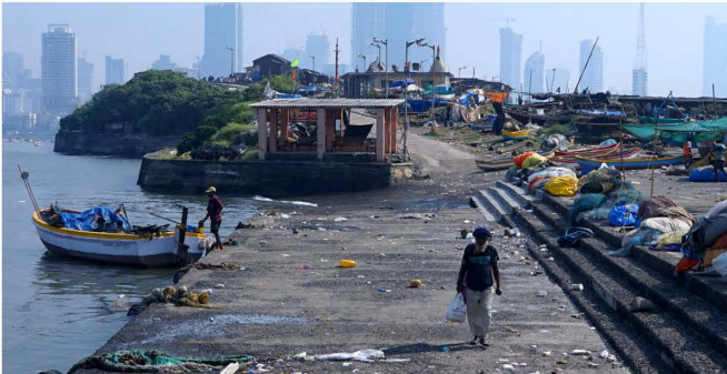
view h: Looking south along the east coast of the competition site