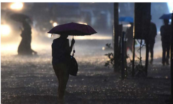
Flooded street in Mumbai

Worli Koliwada sits on the northern tip of Worli, one of the seven original islands of Mumbai. Some of the village's current inhabitants are direct descendants of the Koli that pre-date the Portuguese, who took control of the islands in 1534. The colony was handed over to the British in 1661, who built a fortlet in 1675 to surveil their coastal position. The fort was renovated in 2007 and retains its original footprint, and now houses an unofficial gym and temple. There are nearly 40 koliwadadas (fishing villages) in Mumbai, many of which are under threat due to steady declines in annual catch and competing development interests. 9 On record, the 65-acre Worli Koliwada counts 457 residences, but over time residents have constructed additions and new structures for supplementary income. 10 Population estimates range from 60,000 to 100,000, with a mix of Koli and migrants from around the country.