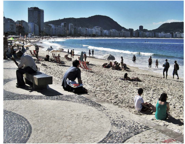
Copacabana Beach in Rio de Janeiro, designed by Roberto Burle Marx

RESIDE seeks a more inclusive approach to development in the megacity, that brings together socio-economically disparate constituents in both the private and public realms. Through what strategies can architecture create places where all residents have a feeling of belonging and ownership?