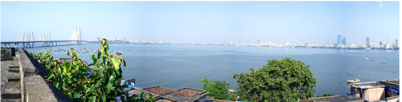
view d: From Worli Fort looking east over Mahim Bay